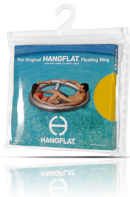
4) The HANGFLAT® packaging