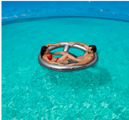
1) The HANGFLAT® couple photo

Further inquiries please call (+507) 6618.0003 or (+507) 6618 9944, or email hangflat@culteva.com