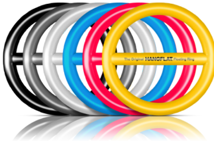
5) The HANGFLAT® range