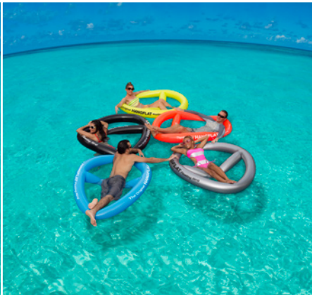
2) The HANGFLAT® group photo