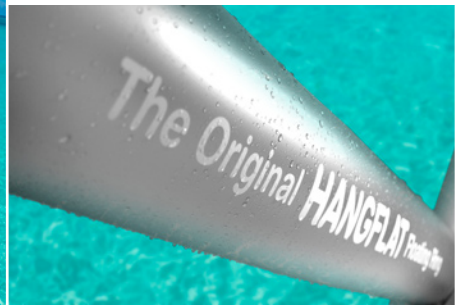
3) The HANGFLAT® close-up detail